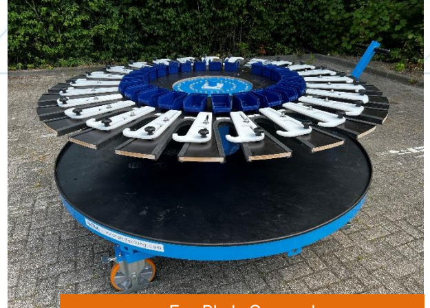
Fan Blade Carousel

Other platform dimensions and aircraft combinations upon request