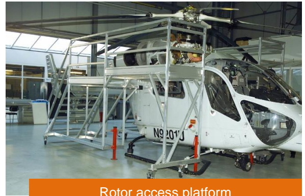
Rotor access platform