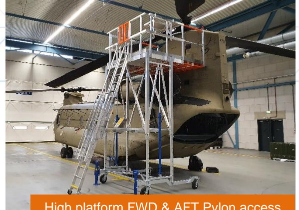
High platform FWD & AFT Pylon access