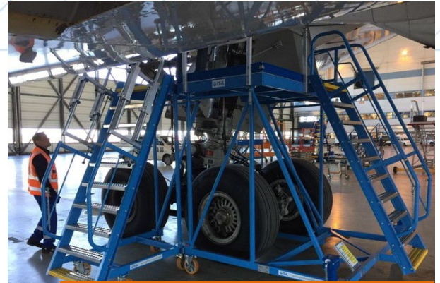
Main Landing Gear Stand

Other platform dimensions and aircraft combinations upon request