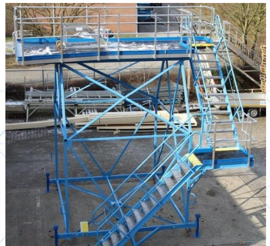
Stable and robust design with fixed stairs