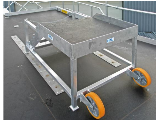
Large working platform