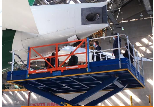
Large working platform

Other platform dimensions and aircraft combinations upon request