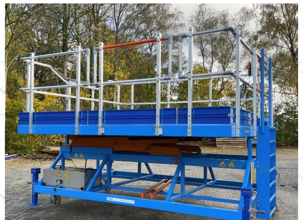
APU scissor lift in lowest position