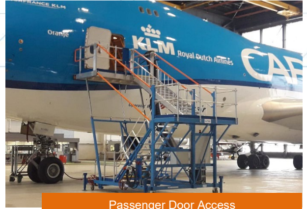
Passenger Door Access

Other platform dimensions and aircraft combinations upon request