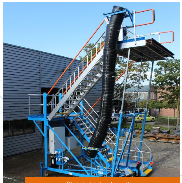
Stair in highest position