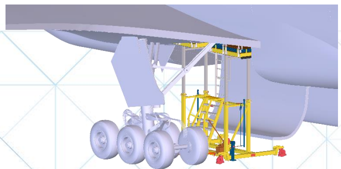
Dedicated Access Platform for P2F - Reference Project