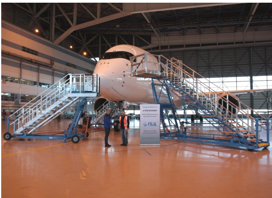
Access Stands for A350