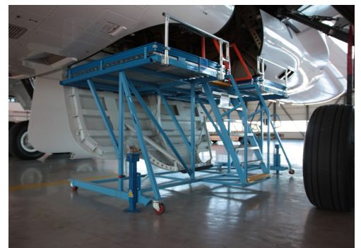
Wheel Well Stand for A350

Hence, by using one piece of NIJL equipment, you can access several aircraft types. This means less equipment needed, and therefore lower cost.