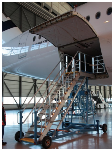
Cargo Door Stand