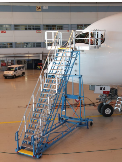
PAX / Cockpit Window Stand