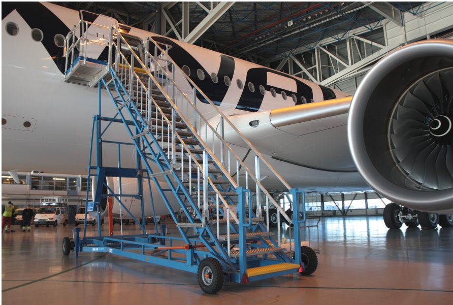
PAX Stand for A350