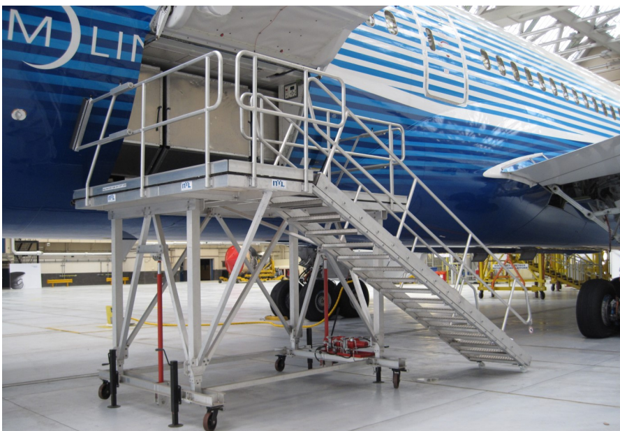
Cargo Door Stand for B787