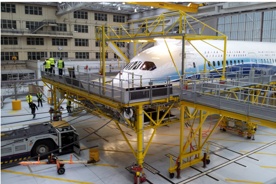
Nose / Fuselage Dock for B787

“With the advanced 3D scanner we are able to make detailed 3D aircraft scans to ensure optimal access to specific areas around the aircraft.”