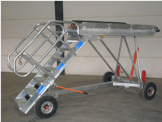
Detailed 3D scanning resulted in 3D drawing and from there to the development of the B787 Nose Landing Gear Stand.